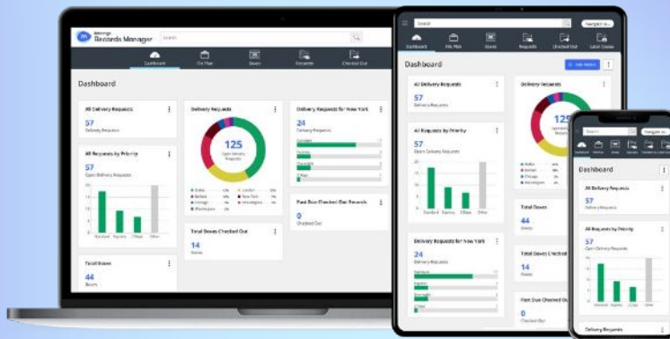
Single user interface for electronic and physical content

buildings, offices, file rooms, zones, racks, shelves, and other specific locations